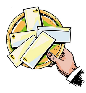
Find the how-to details here: stphilipstoronto.com/donate-now/

As we move through spring please consider continuing to make your weekly donation.