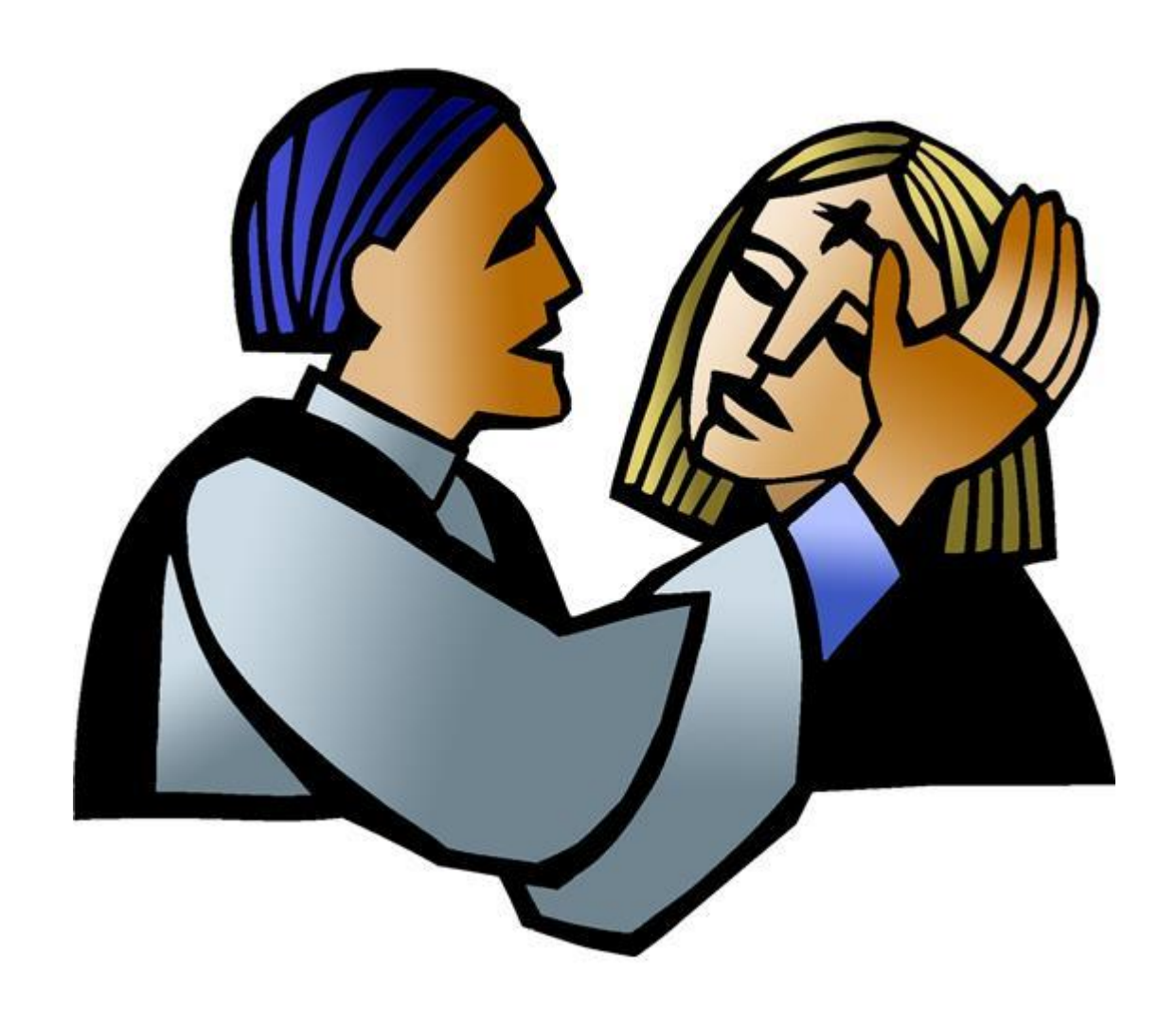
St. Philip's Lutheran Church